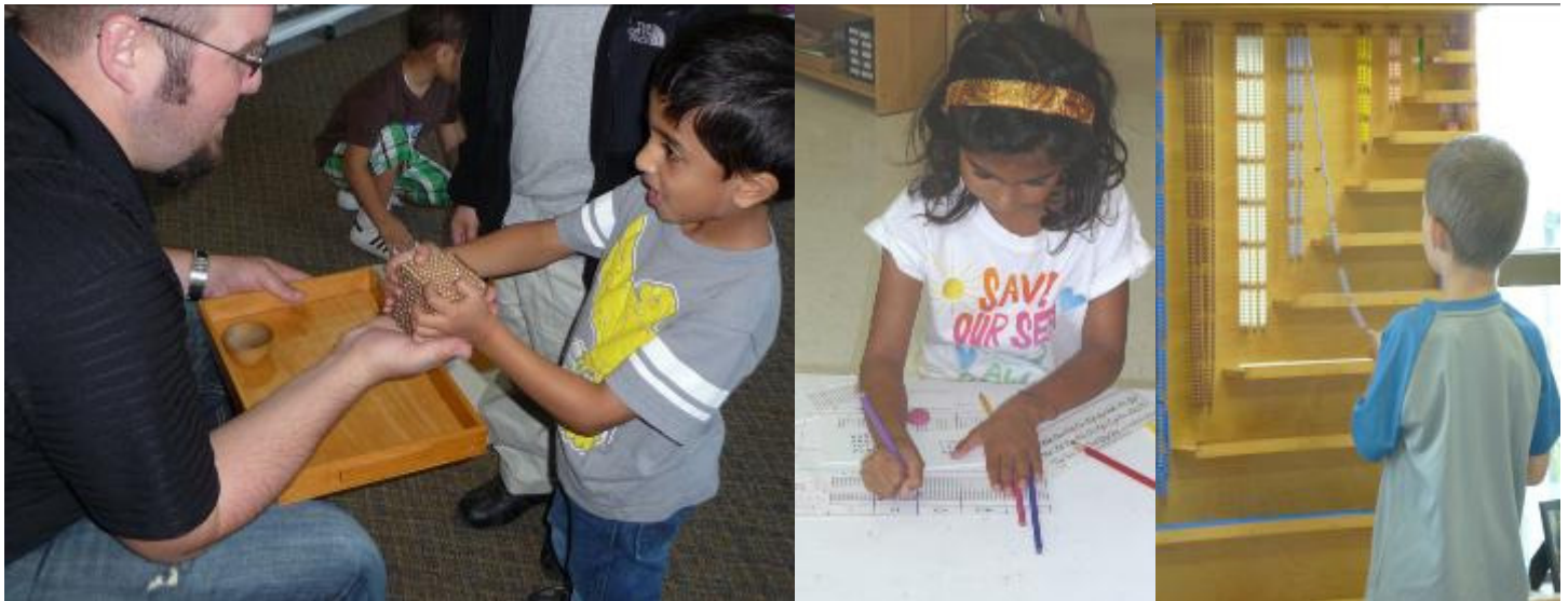
Understanding mathematics: (left) “This is 1000.” (center) Adding 2,265 + 5,832 + 3,173. (right) Multiplication, squaring and cubing with the Bead Cabinet.