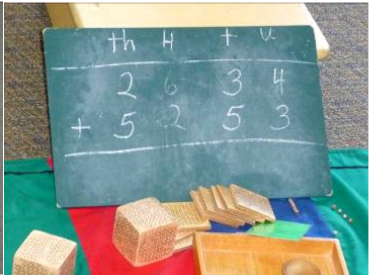
(left) The Hundred Board is used to place numerals from 1 to 100 in groups of ten. (right) A kindergarten student works on an addition problem involving place value (units, tens, hundreds, thousands) without regrouping.