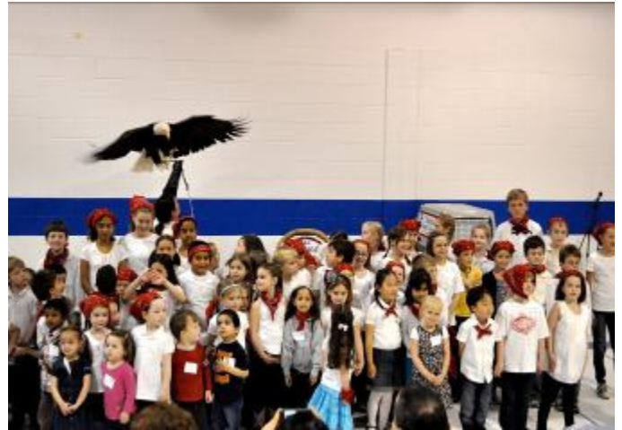
Angel from the Eagle Center visited during Saturday's well attended Spring Round Up.

The Pinecones are investigating worms and watching how they move. The children planted sunflower seeds, and they are now watering and watching the plants grow. A variety of art activity is taking place including mixing paints and observing what new colors appear, collage work, and painting with different objects and textures. The children are listening to books about ducks and planting gardens as well as the windy day, rainy day, and sunny day books. Spring songs are about the rain, caterpillars, robins, and butterflies. Thursdays are baking days and the breads made include blueberry, mixed berry, apple cinnamon, and chocolate chip.